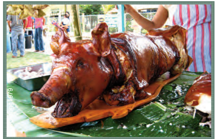
Sweet, tender pork

Cebu is quite famous, even within the Philippines, for Lechon Baboy , usually simply called “ Lechon .” Lechon is a whole pig, roasted on a spit; usually a suckling pig is roasted and is called “ Lechon de Leche .” There are many ways to make Lechon Baboy , but the most popular is to stuff the cavity of the pig with lemongrass, salt, and spices, put it on a spit, and allow it to roast over coals for several hours.