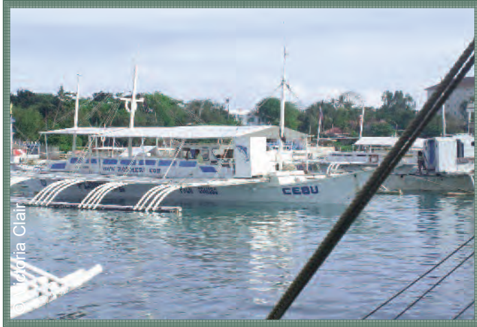
Olango-Cebu...a short ride to a dream

salt-water pool for as long as you like. Most of these resorts are built right on the water's edge, so swimming in the sea is also an option. I use the pool at one of the resorts to exercise three or four times a week.