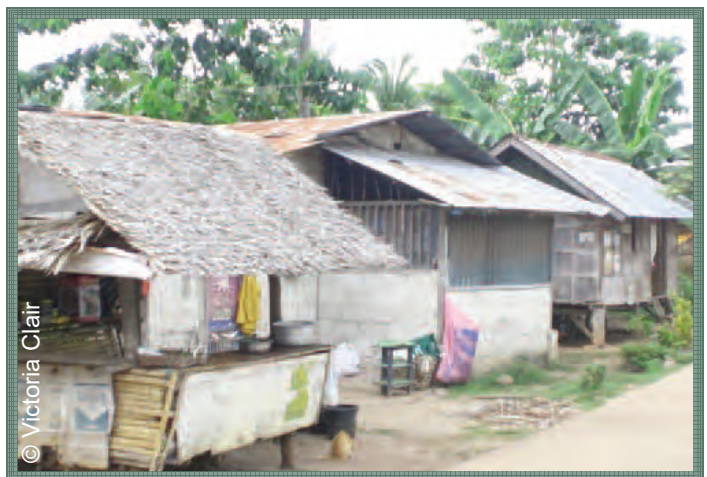
Basic living on stilts

There are several small resorts on Olango Island and the restaurants run by these resorts are popular places for expats to have an evening out. Delicious meals can be purchased for about US$6 per person. You can pay an extra US$2 and have use of a