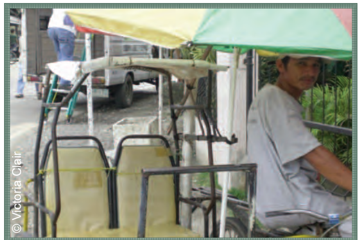
Low speed taxi ride