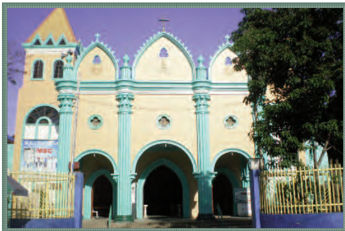
St. Roque parish church, Cordova

Until Mexico proclaimed independence from Spain in 1810, the islands were under the administrative control of Spanish North America, resulting in significant migration between North America and the Philippines. This period was the era of conversion to Roman Catholicism. A Spanish colonial social system was developed with a local government centered in Manila with considerable clerical influence. Spanish influence was strongest in the Luzon region and the central Visayas, but less so in Mindanao.