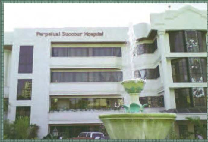
The Sisters of St. Paul of Chartres

There are all kinds of hospitals in the Philippines. Those that are considered “first rate” here might be considered average in the United States. Those that are charity hospitals here would be a foreigner’s nightmare. Cebu has several good hospitals. Chong Hua Hospital is an “Accredited Institute of the Joint Commission International.” Cebu Doctors’ University Hospital is also an excellent facility. Perpetual Succour Hospital is run by an order of Sisters. These three hospitals have up-to-date modern facilities and technology and offer excellent medical care.