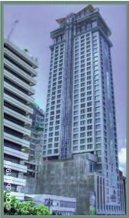
The tallest building in Cebu City - The Crown Regency

One of the corporations building high rises in Cebu is Horizons Cebu . These buildings are located near the Ayala Mall in the middle of the business district.