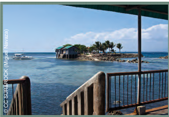
Island hopping from Olango