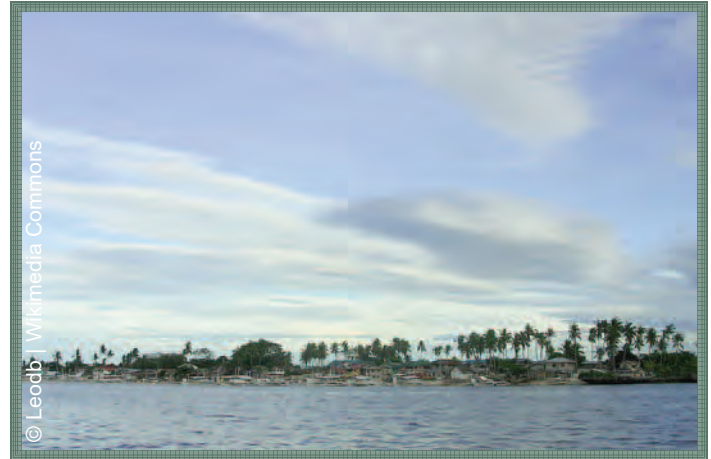
Looking back at Olango

million in the city proper. Cebu City has nearly 1 million residents, and is the second largest city of the Philippines. As of 2010, the country's estimated population was just under 100 million.