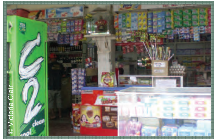
Shopping for basics

Rents on Olango are so much lower because houses have few amenities and, despite all the wonderful reasons for living here, there is still the inconvenience of having to take a boat and other transportation to shop and do other errands. There just aren’t many places to shop here on Olango other than the small, local, family-owned, convenience stores.