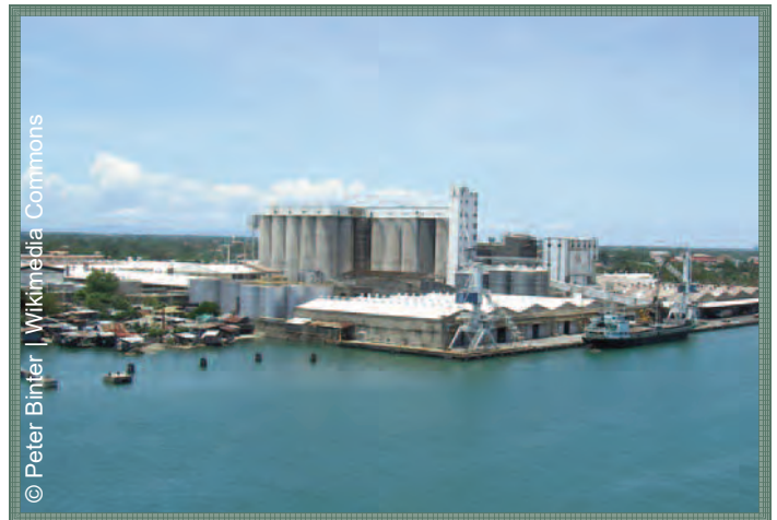
Mactan Harbor, near Cebu

The Philippines has a tropical climate that is often hot and humid. Cebu, Mactan, and Olango are protected by outer lying islands from the fierce typhoon winds that beat on the island of Luzon most years. The rainy season runs from October through December, but this only means that it usually rains for an hour or less every day. The rest of the time, the sun shines and people enjoy all that the islands have to offer.