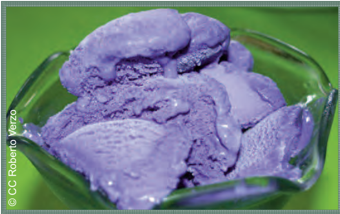
Über delicious Ube

Desserts in the Philippines also have a heavy Spanish influence. One of the most popular is Leche Flan, otherwise known as Crème Caramel. Egg Pie, known in the United States as Custard Pie, can be found in just about every Filipino bakery.