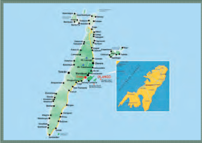
Little ol' Olango...one expat's dream

Foreigners soon learn that it saves them a great deal of money to have their home help shop at the local wet markets or even go to Immigration for them. Wet markets are very much like Farmers' Markets, with locals selling vegetables, fruit, fish, chicken, pork, and eggs. There are also stalls that sell anything from flip flops to household items. Filipinos make no secret of the fact that they will charge a foreigner as much as they think they can get, often two or three times the going Filipino rate. A Filipino helper can cut through this and get their employer the best price.