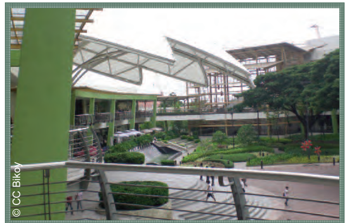
Upscale shopping at Ayala Mall

To avoid this problem, I choose to shop at the more upscale supermarkets. The produce is fresher and more attractively arranged, the meat is handled more safely, and the employees are