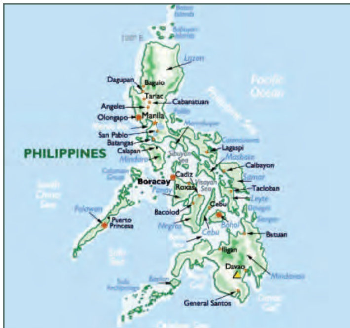
An island nation

Manila, the capital of the Philippines, is the largest city, with a population of over 10 million in the greater metro area and 1.5