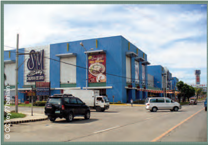
SM City Mall – a source of fabric

long-term and, therefore, know more about what is available in the store. Even the baggers are better trained, and know not to put light, soft items at the bottom of the bag! These more upscale supermarkets also carry more international foods, so foreigners can often find products that they would have been purchasing back home and hanker after such as German sausage, cranberry sauce, spaghetti squash, cold cereals, favorite beer brands, international coffee, and other favorites.