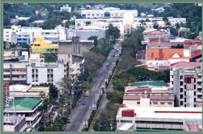
Cebu City's Osmena Boulevard

rooms of the house during the day and early evening, and then in the bedrooms at night could bring the electric bill to at least US$150 a month. I have found that well-placed fans help to keep me relatively cool, especially for sleeping.