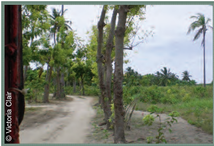
Dirt road on Olango