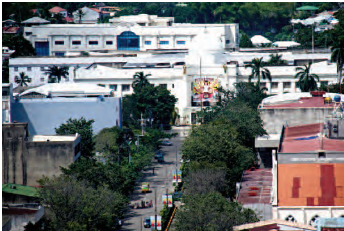
Cebu...Something old, something new

Buying clothing and shoes is easy enough for an expat man here in the Philippines, even if the man is larger than the average Filipino. There are enough tall and large Filipino men for the larger department stores to carry x, xx, and xxx sizes. It is much more difficult for women to purchase the clothing and shoes they need. First of all, wide shoes for women are difficult to find, and most Filipino women are small, many wearing size "0" or "2." Larger women have most of their clothing made for them by a local tailor or seamstress. Many expats have their clothing copied by local seamstresses. One takes an article of clothing and the fabric to a seamstress and a week or two later the finished product will be ready to collect. Most articles of clothing cost about 300 pesos (US$6.50) to have made. Seamstresses will work from patterns, but you have to supply them, there aren't any available here. I have had a bathing suit made for me, and all I did was supply a very basic drawing of what I wanted.