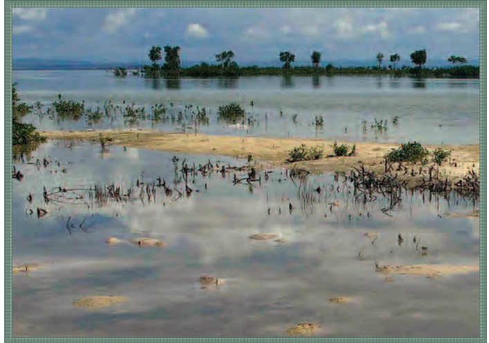
Olango's wetland pit stop for migratory birds

Even with all of these drawbacks, I love my life on Olango. It is quiet and smog free. I live right on a lovely, private sandy beach with yellow, pink, white, and red wild flowers growing everywhere. Except for those days when I need to take the boat over to Mactan or Cebu for errands or for visiting with friends over lunch at a restaurant at one of the malls, my days are free and unstructured.