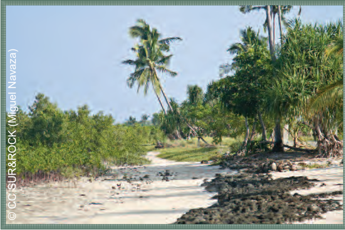
Simple yet inviting – a winding Olango beach path

There are 175 native languages in the Philippines. In Cebu, most Filipinos speak Cebuano, but are also able to speak Tagalog. The great majority of Filipinos living in Cebu can speak at least rudimentary English. Most often, education and economics dictate the individual's level of spoken English. Almost all Filipinos understand English, though many, especially in the provinces, are not comfortable speaking it. Those who attend good schools and universities speak excellent English, and are as comfortable in English as they are in Filipino.