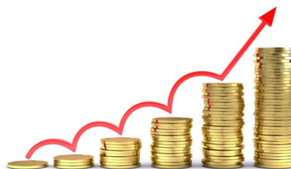
Gold in mutual fund, must report...