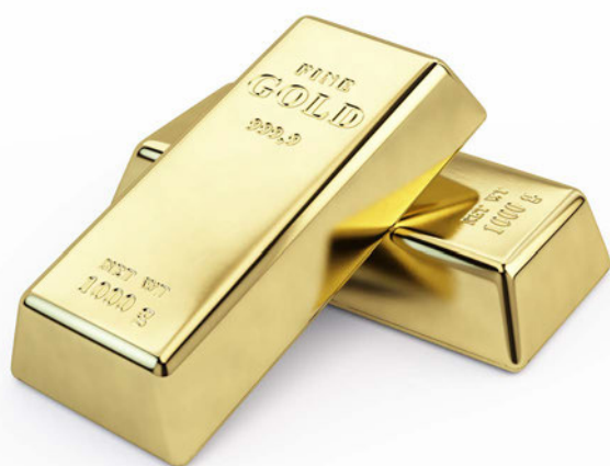
Physical gold not in account, no need to report...

No. Directly held precious metals, such as gold, are not specified foreign financial assets. Note, however, that gold certificates issued by a foreign person may be a specified foreign financial asset that you would have to report on Form 8938, if the total value of all your specified foreign financial assets is greater than the reporting threshold that applies to you.